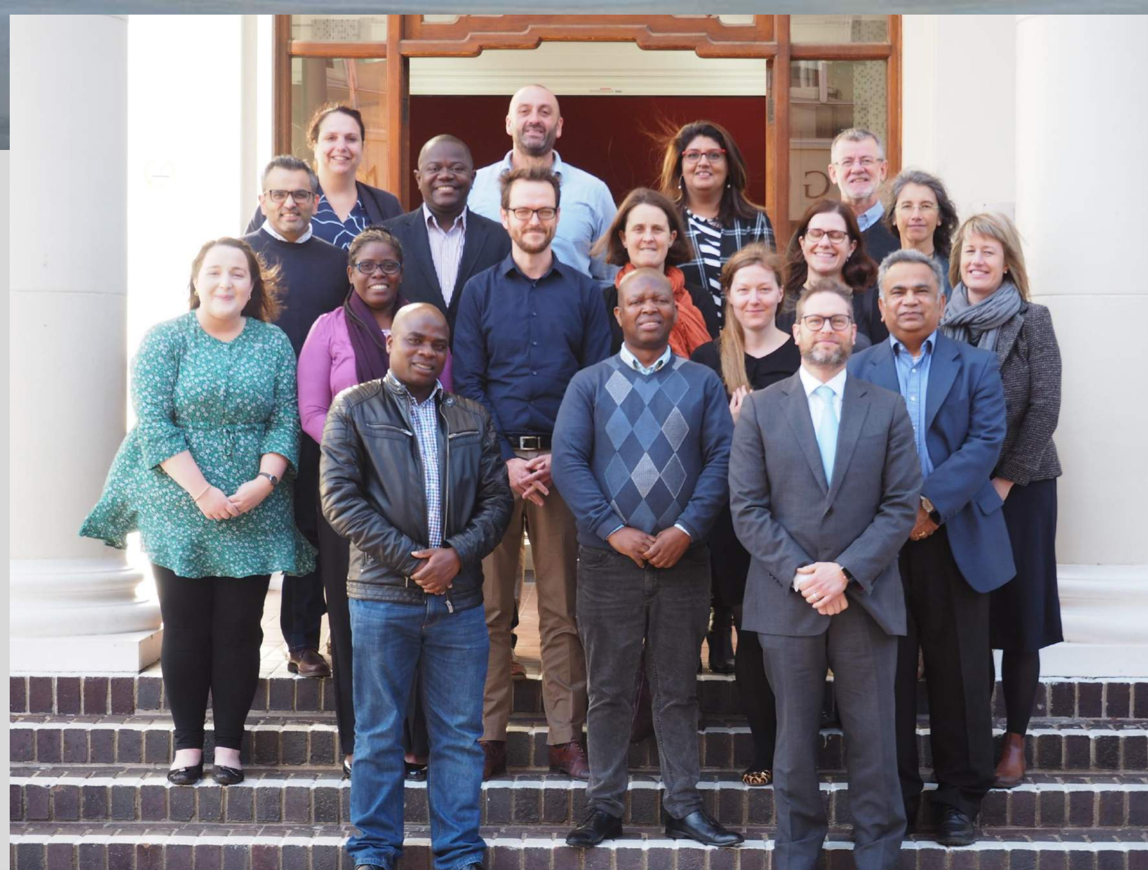
A wind-swept project team during the scoping workshop in Stellenbosch, 28-29 May 2019.

The project builds on Bath’s and Stellenbosch’s experience of delivering innovative and blended doctoral programmes for international student cohorts in the social sciences, and will allow sharing good practice developed around the UK’s Researcher Development Framework (RDF) with South Africa’s recent review of doctoral standards and PhD graduate attributes.