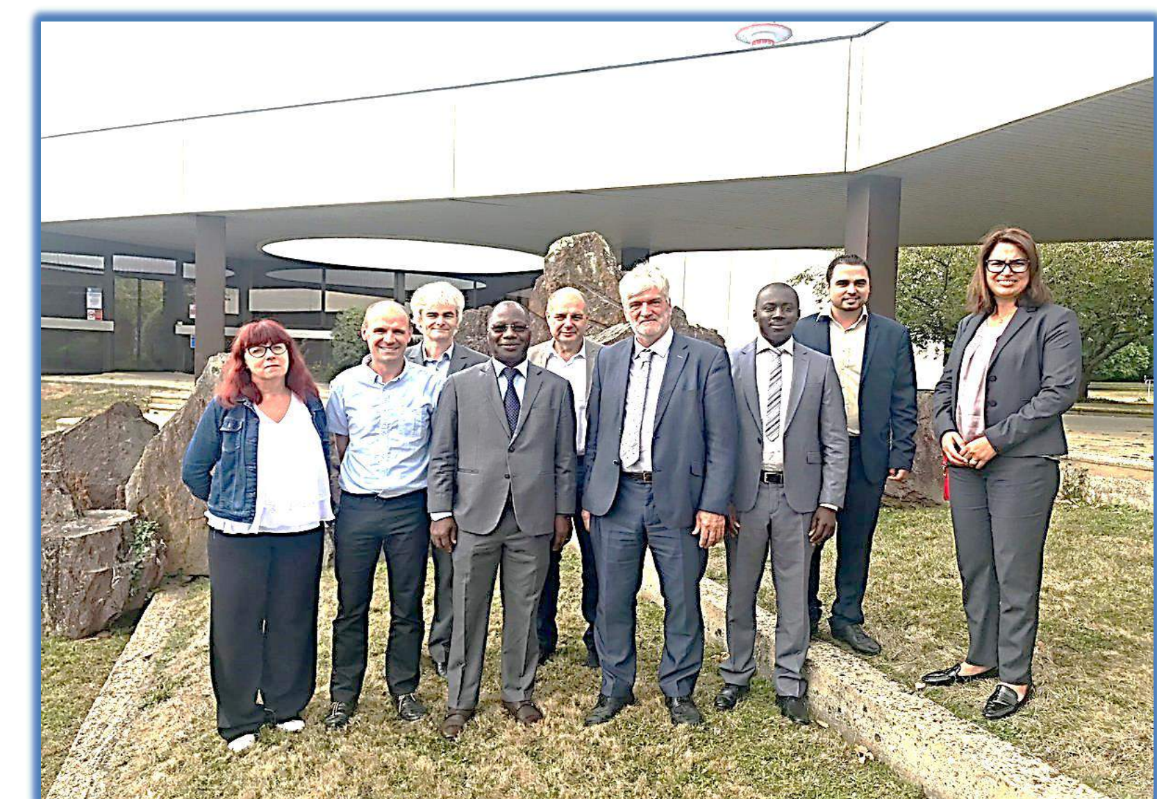
Kick-Off meeting – 16-17-18 Sept. 2019 (CentraleSupélec, Rennes, France)